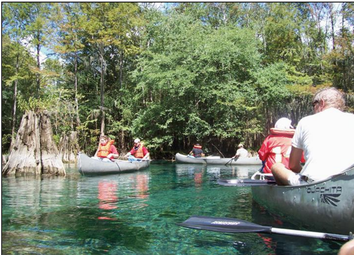
Bainbridge College Canoe & Kayak Club members circle cypress stumps as they travel Spring Creek on a Fall Semester 2009 trek. Below is a view as they go down river.