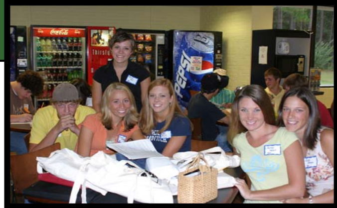
High school students from Decatur County and other surrounding counties await orientation.

The Bainbridge College Student Center was full of anxious and excited area high school students from surrounding counties for the Post Secondary Option Orientation, Dual Enrollment Program Monday, August 9 th .